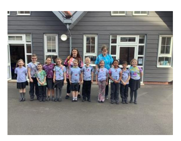
A few of us have also joined the 'Hedgehog Committee' We are very proud of our hard work and dedication.