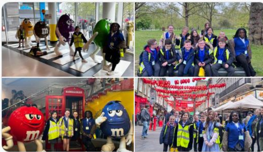
The West End - M&Ms and Green Park

The children went on Mersey Rail, a mainline train, the tube, a London bus and, finally, a taxi!